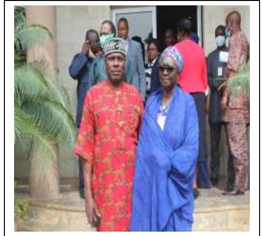
NVRI Vom Governing Board members at various functions in the Institute.