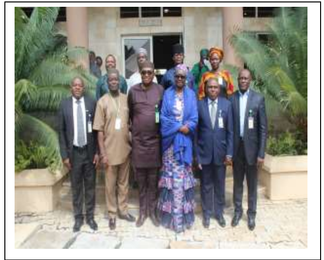
Cross section of participants at the NVRI Vom Strategic planning retreat for Directors, Assistant Directors, Heads of Divisions and Change Agents