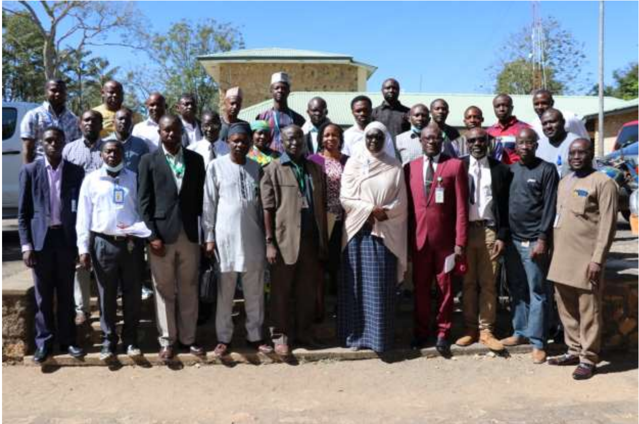
Director/ Chief Executive, NVRI Vom (5 th from the right) pose for group photograph with participants at a 3-day training on equipment maintenance organized by the Quality Assurance Division, NVRI Vom