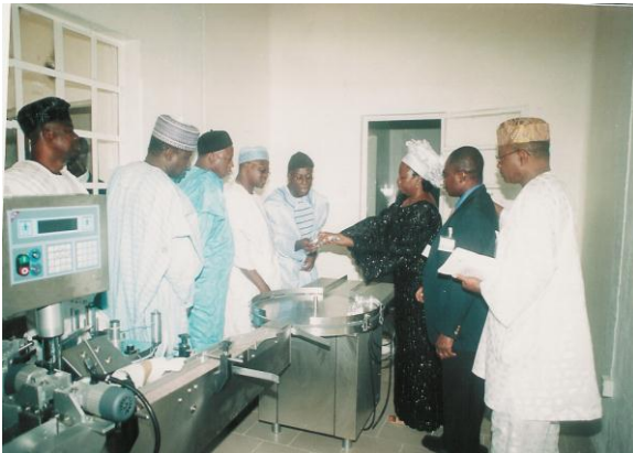
New Digital Vaccine Freeze Drier : Commisioning of vaccine production equipment by the President 's Representative, Chief Audu Ogbe