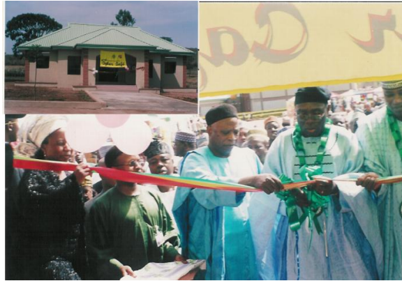
NVRI Cybercafe: Commisioning of IT facility by the Hon. Minister of Agric. and Chief Audu Ogbe (Representative of the President, Fed. Rep. of Nig.) and other Dignities observing