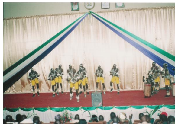
Variety Night: Jarawa Dancers of Plateau State